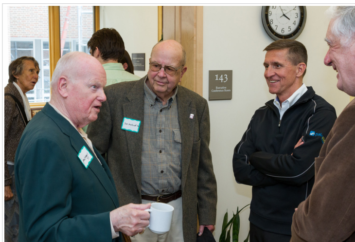
Members of the Classes of 1950-59 meet with the 2015 Class of '50 Senior Foreign Affairs Fellow LTG (ret.) Michael Flynn.

The public talk is typically the highlight of the visit to campus during which the Fellow meets with student and faculty groups and guest lectures in classes. Classmates, wives and guests of the Class of 1950 are invited to a reception preceding the keynote talk. Our most recent Senior Foreign Affairs Fellow was Michael T. Flynn, Lieutenant General, United States Army (Retired), who spoke on April 29, 2015, on "A World Without Order: Threats and Challenges in the 21st Century." ■